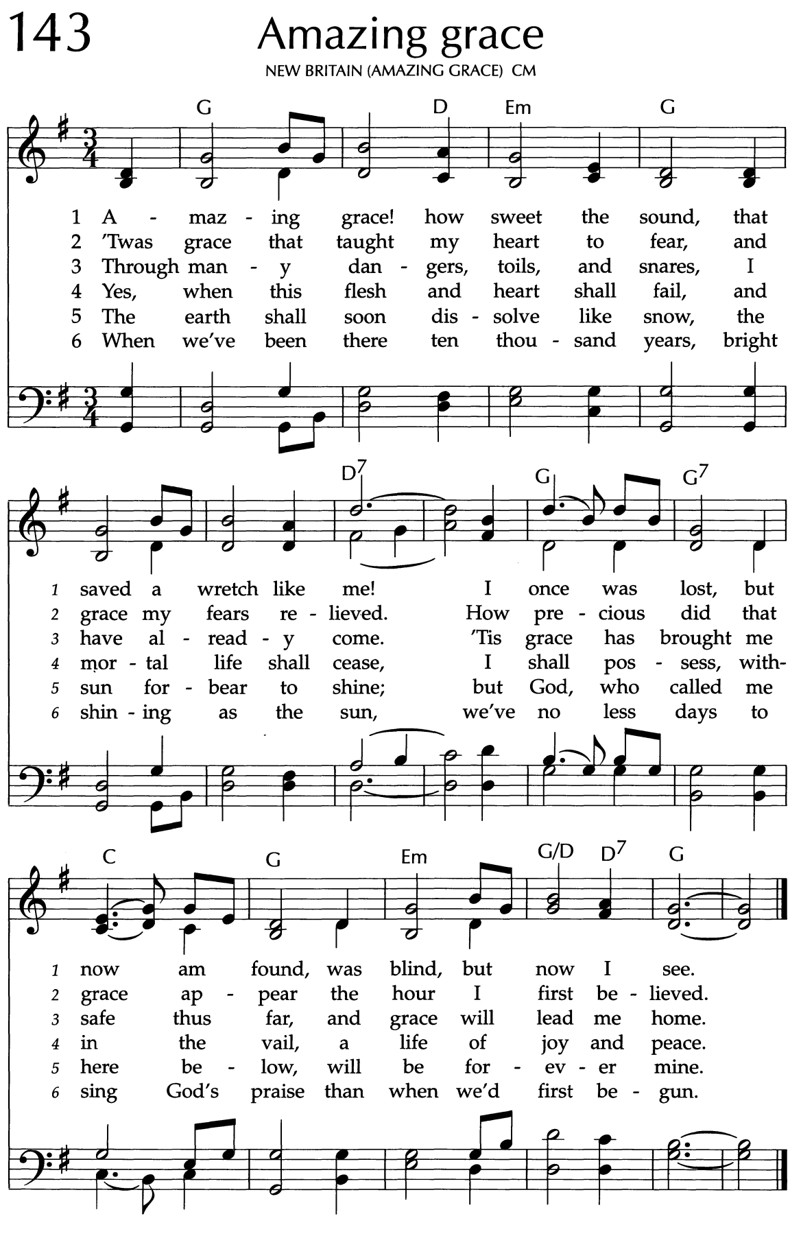
Text: John Newton (Sts. 1-5), Olney Hymns , 1779, A Collection of Sacred Ballads (St. 6), 1790 Music: American folk melody, Virginia Harmony , 1831; adapted and harmonized by Edwin O. Excell, 1900